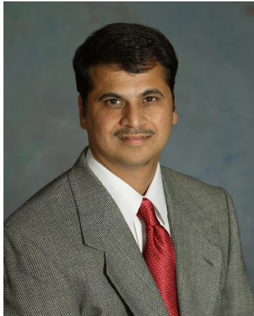
Your Personal Therapist